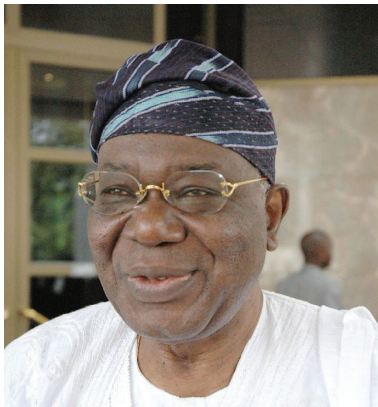
The late Shonekan

Speaking on Thursday at the Wake Service and Night of Tributes for Ernest Shonekan held at Victoria Island in Lagos, Sanwo-Olu described the former Chairman and Managing Director of the United Africa Company of Nigeria (UACN) as a foremost, highly respected industrialist and corporate administrator as well as a first-class boardroom guru with an enviable track record.