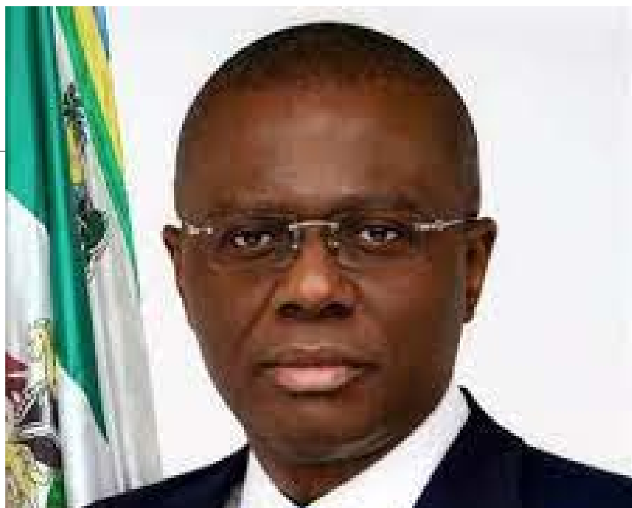
Governor Babajide Sanwo-Olu

Wahab also commended Sanwo-Olu for putting his full weight behind the establishment of the two additional universities. He also appreciated the Lagos State House of Assembly led by Rt. Hon. Mudashiru Obasa for believing in the process.