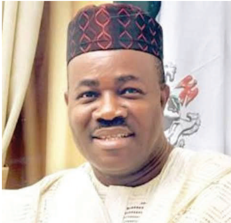
Sen. Godswill Akpabio

But some members of the PDP told The Trumpet that the banner at the venue of Akpabio's declaration was a product of the discontentment with Akwa Ibom PDP and not that of mischief makers as claimed by the party