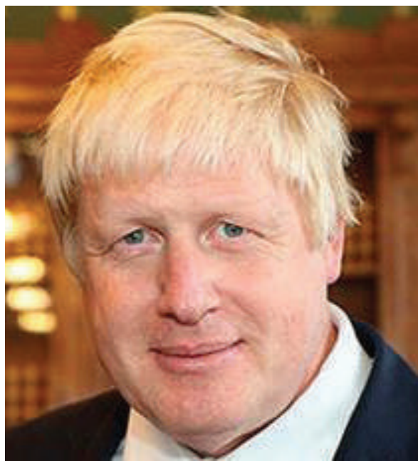
UK Prime Minister, Boris Johnson

send a strong message by working with the Nigerian government to ensure that any return