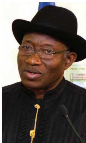
Former President Goodluck Jonathan

or the transformer develops a fault, those using such transformer are made to pay for the fuss, cables or its repair or spend several days in darkness, but will still be billed monthly notwithstanding the several days of outage.