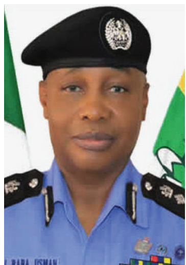
IGP, Usman Alkali Baba

"The IGP further warned officers to ensure total compliance with the laws guiding the Force as any breach would be severely sanctioned," the statement said.