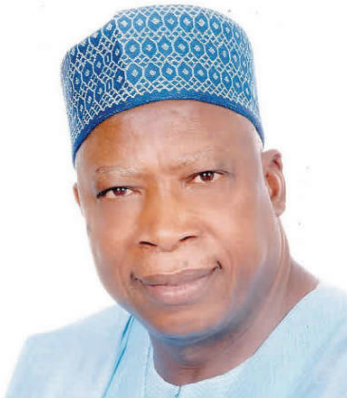
National Chairman of APC, Abdullahi Adamu