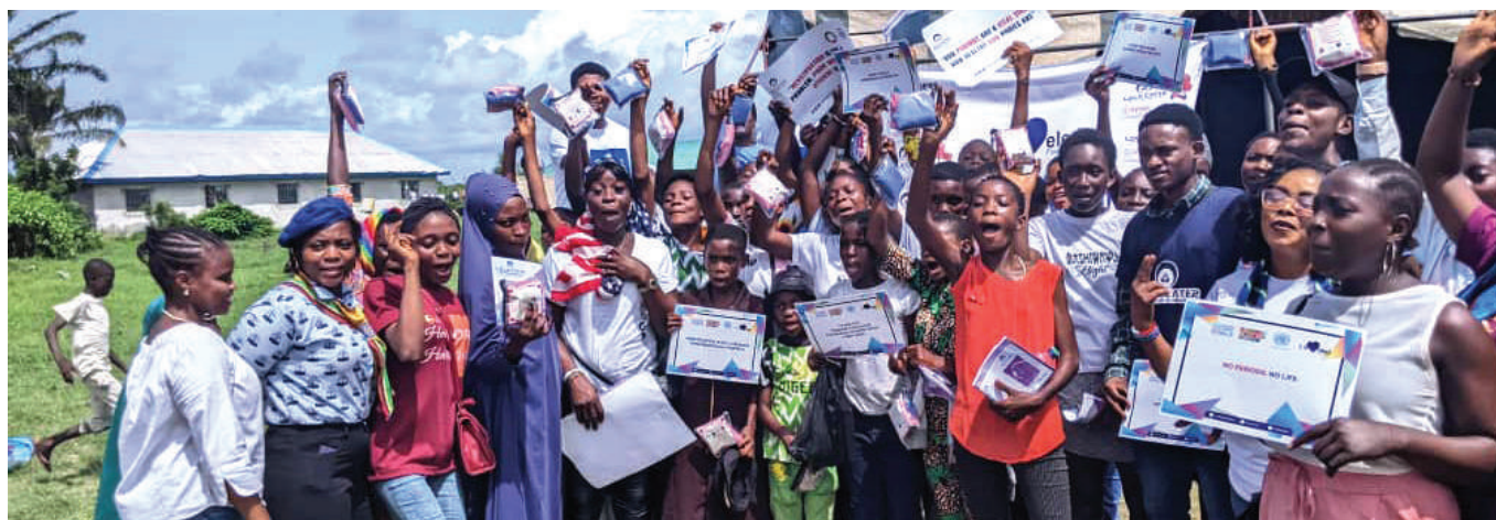
Teenage girls at Ifako-Tomaro community receive free reusable sanitary pads from Loveled Foundation

He also noted that inadequate sanitary facilities, lack of access to affordable and