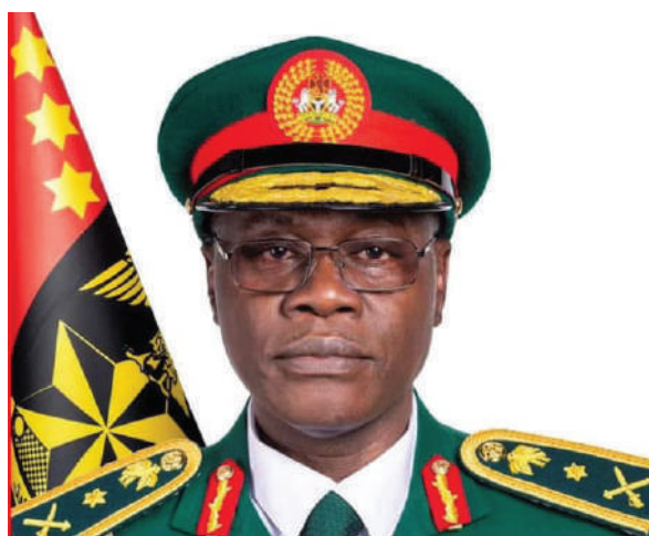
Lt Gen. Yahaya

Similarly, the Commissioner of Police in Cross River