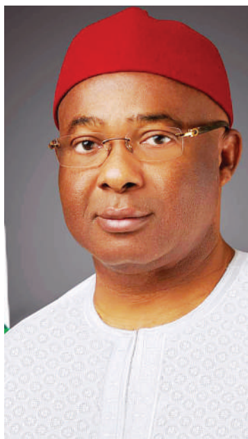
Gov. Hope Uzodinma