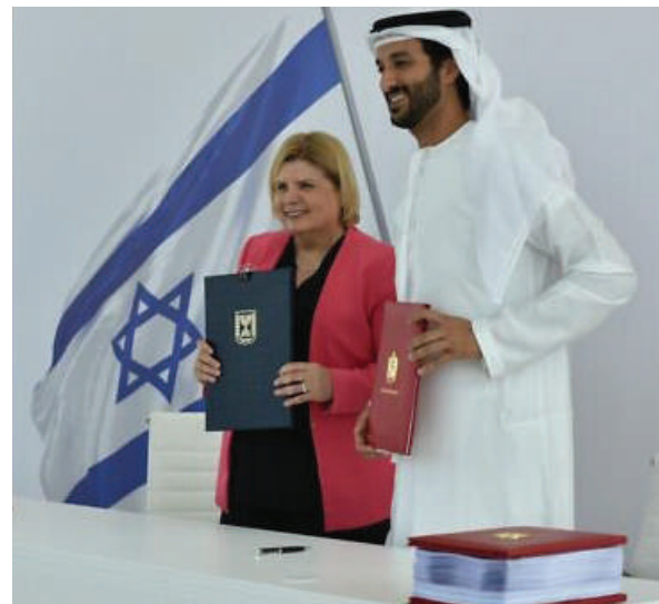
L-R: Israel's Minister of Economy and Industry Orna Barbivai and her counterpart, UAE Minister of Economy Abdulla bin Touq al-Marri, after signing the agreement on Tuesday

The UAE was the first Gulf country to normalise ties with Israel and the third Arab nation to do so after Egypt and Jordan.