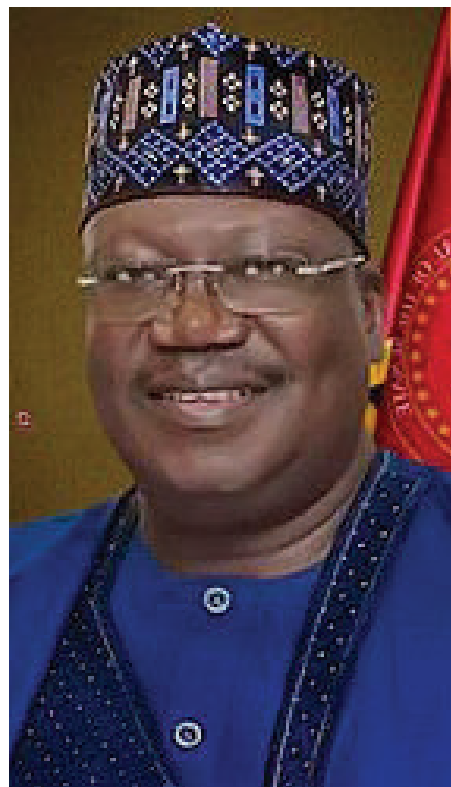
Sen. Ahmad Lawan

In some cases, the marathon meetings between the Ad-hoc Committee and the various communities and representatives of the state governments lasted till about