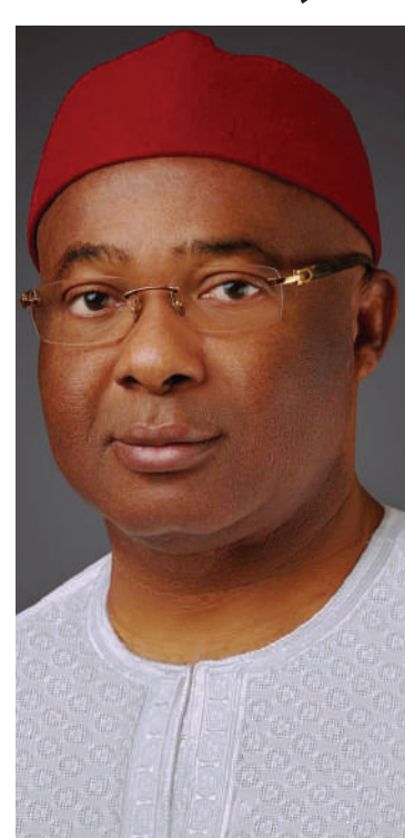
Gov. Hope Uzodinma

"Let me also use this auspicious occasion to salute those whose tenacious struggles and invaluable sacrifices brought us to the glorious dawn of the democracy we are savouring today. I hail Chief M. K. O. Abiola, our martyr of the struggle. I salute our own Chief