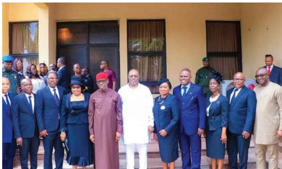
Gov Okowa 5th left with newly sworn in judges

The governor remarked that the judiciary, in a constitutional democracy, was saddled with the responsibilities of interpreting the constitution, upholding federal principle of maintaining balance between various organs of government, adjudicating the laws,