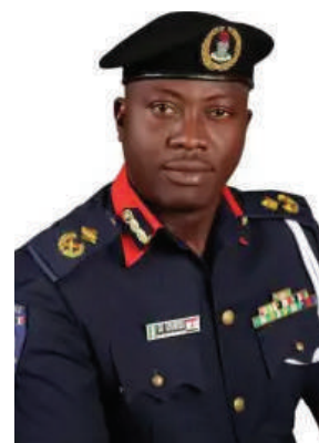
DCC Olusola Odumosu

while investigation will be carried out with due diligence to unravel the other criminals connected to the crime for possible prosecution," Odumosu said.