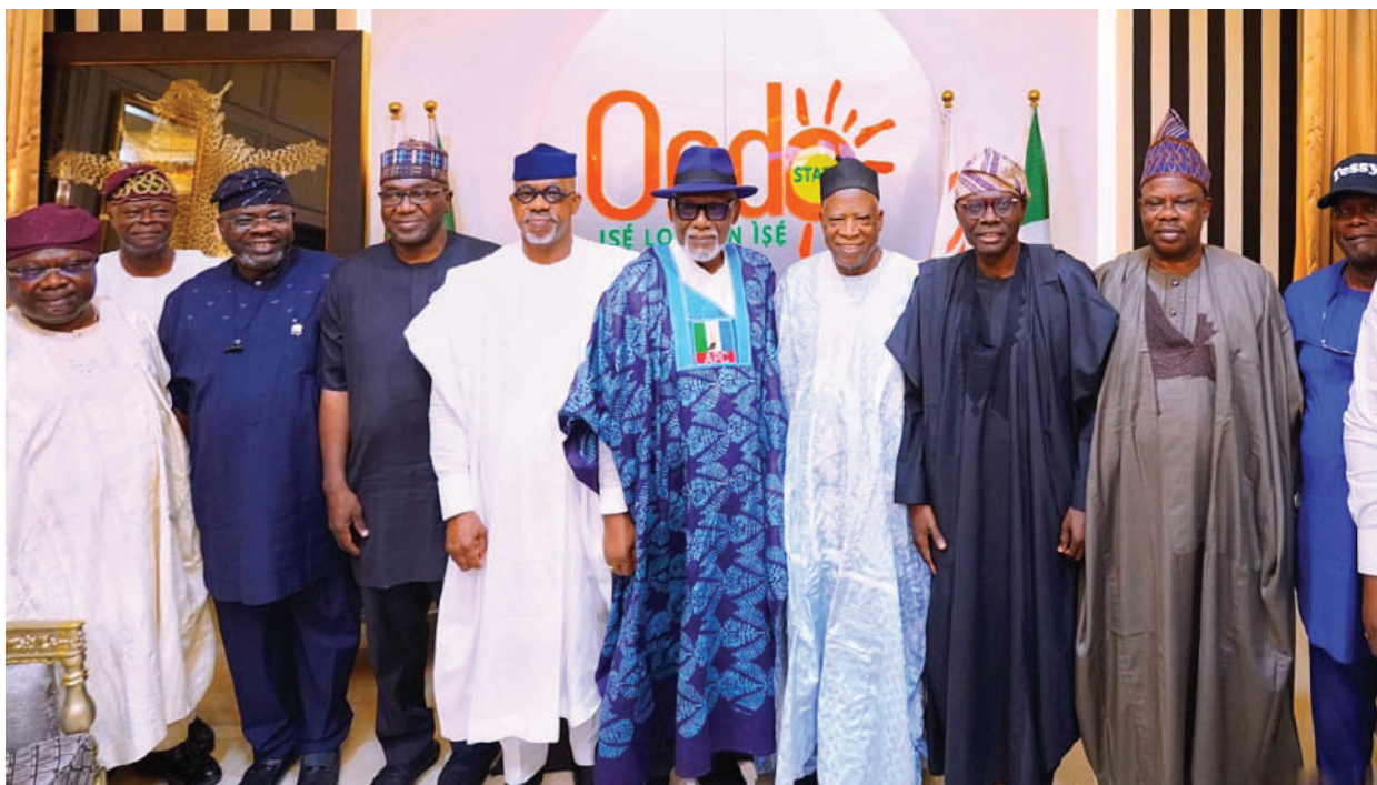
L-R: Senator Iyiola Omisore; members of Lagos Governor's Advisory Council, Hon. Wale Edun and Alhaji Mutiu Are; Governors Abdulrahman AbdulRazaq (Kwara State), Dapo Abiodun (Ogun) and Rotimi Akeredolu (Ondo); National Chairman, All Progressives Congress (APC), Alhaji Abdullahi Adamu; Lagos State Governor Babajide Sanwo-Olu and Senator Ibikunle Amosun, during a condolence visit to Akure over the recent terror attack in Owo.

"If you get to the scene, I'm sure it will bring tears out of your eyes. These criminals, these animals in human skin, what they did was horrendous. They did not come to kidnap, they did not come to steal, they took no dime. They went into the church and shot at everything within their sight", the Governor lamented.