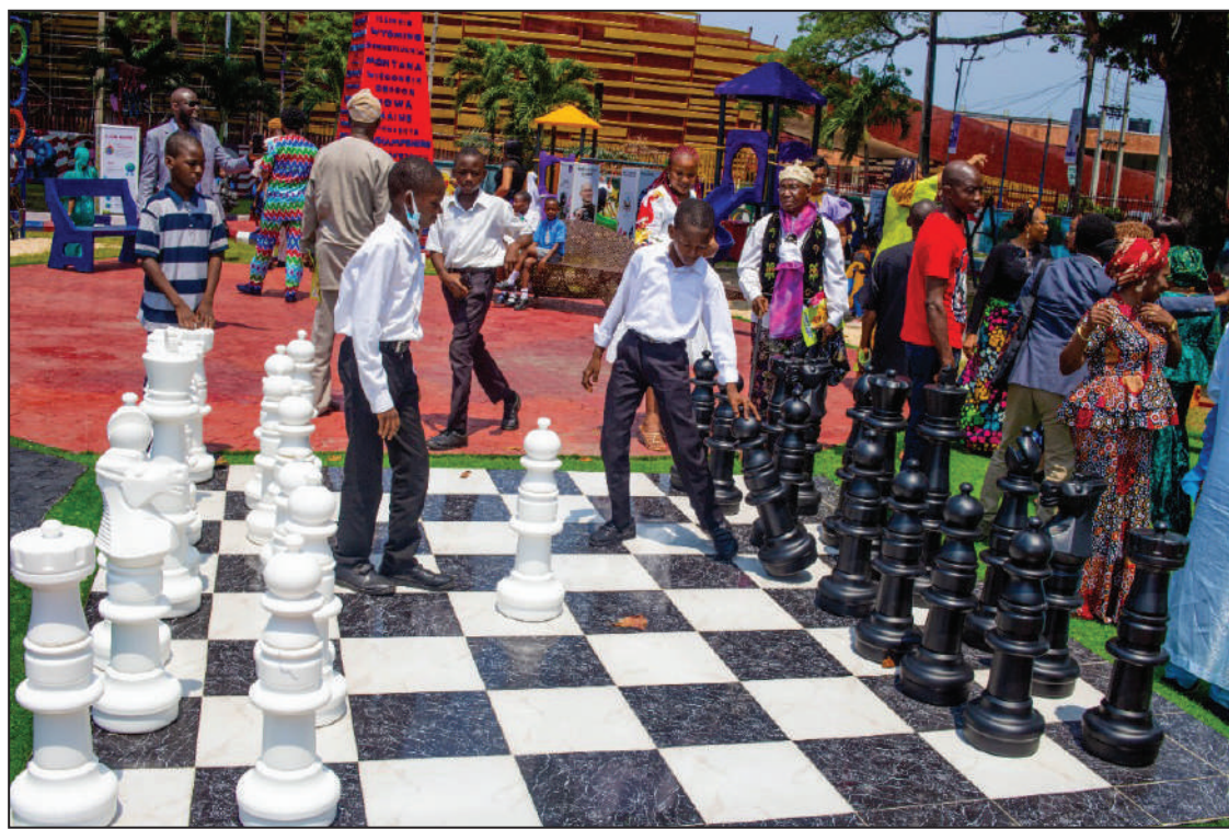
Students playing at the Chess Ground situated within the learning space.

"The above is for the information of the general public, especially the university community, and it is expected that this would serve as a deterrent to others."