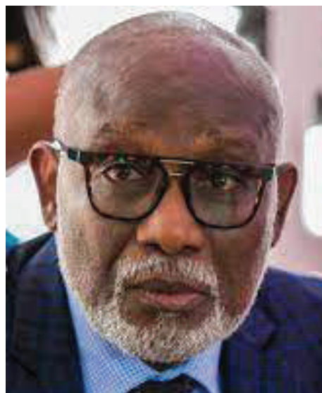
Gov. Oluwarotimi Akeredolu

The governor condemned the attack and called for the immediate rejig of the country's security architecture.