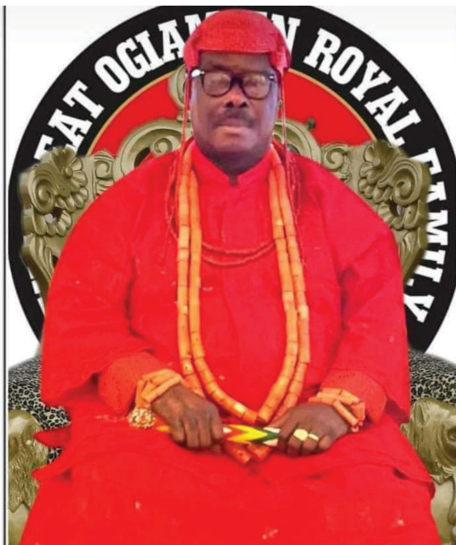
His Imperial Majesty Rich Arisco Osemwengie Ogiamen of Utantan Benin City.

The Edo State Attorney-General and Commissioner for Justice, thereafter sent a letter to the Registrar, Magistrate Court 4 Benin City "The action of the Edo State Government is as a result of the Ogiamen Family's decision to withdraw all pending claims and/or any other authority arising from or related to any claim of sovereignty or traditional authority outside of the position recognized by the laws. As the decision to prosecute His Imperial