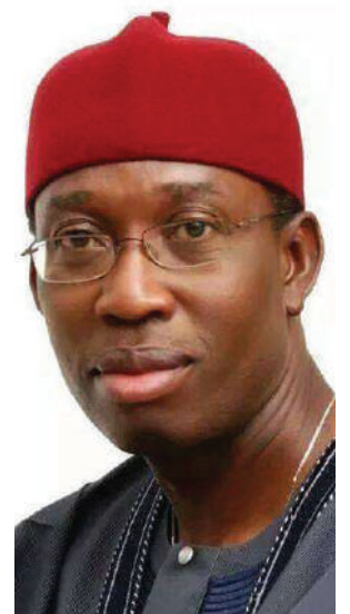
Dr Ifeanyi Okowa

It, therefore, charged Governor Okowa to borrow a leaf from his counterparts in Rivers, Borno, Ebonyi and other states "that are blazing the trail with legacy projects, turning their states into massive construction sites, while paying outstanding gratuities and pensions, rather than take loans with nothing to show at the end of the day"