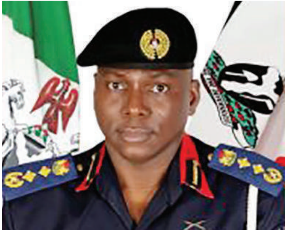
NSCDC boss, Ahmed Abubakar Audi

"Our synergy with sister security agencies remains very robust; we enjoin the public to continue to give us credible intelligence that would assist in nipping in the bud all perpetrators who definitely will not go unpunished," she solicited.