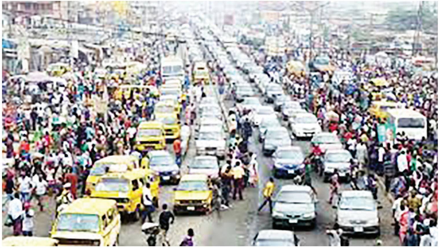
Lagos ranked second worst city in the world

The project development is expected to be completed in December 2024.