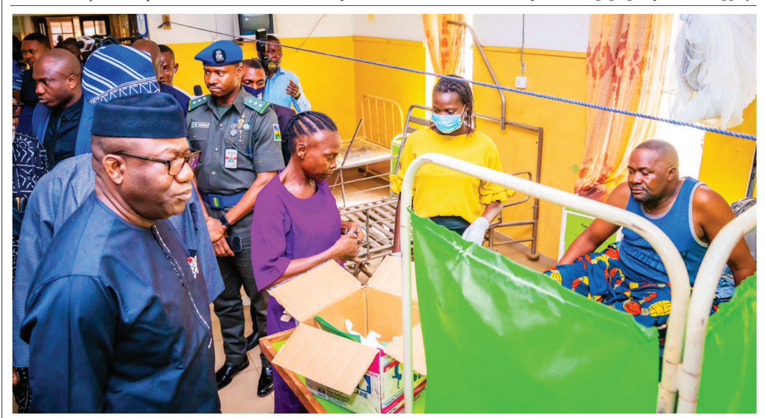
Ekiti State Governor, Dr. Kayode Fayemi; with a victim of the gunmen attack, when he visited survivors of the onslaught at St Louis Catholic

The Police boss reiterated the commitment of the Force to stamping out threats to peaceful and credible elections at all levels, even as he vows to deal decisively with anyone caught engaging in political thuggery.