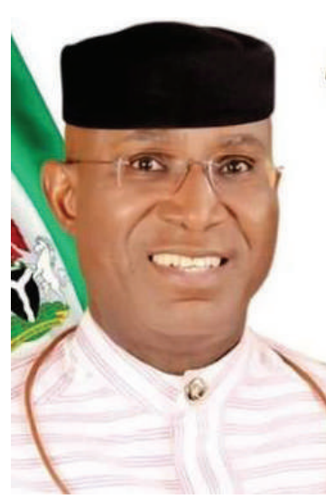
Sen. Ovie Omo-Agege

"We have performed significantly in the capital side of the budget with many outstanding accomplishments in infrastructural development. As a government we have added value to the people of Delta whether they live in the creeks or in the upland so for Omo-Agege to say that N700 billion is not accounted for, you begin to